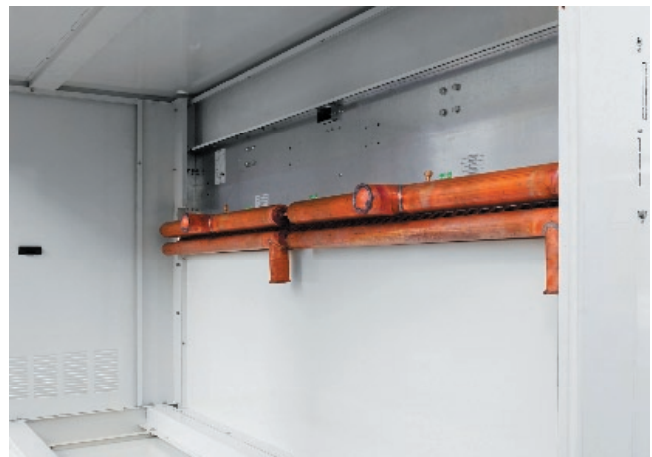
Easy access from three sides. Available with sound absorbing.