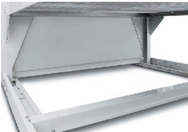
Solid base frame Available as KIT or mounted on the unit.